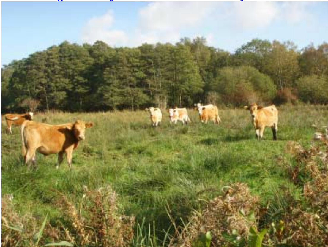
Photo: Grazing marshes adjacent to wet woodland at Barnby Broad

Wet woodland in the Waveney Valley has been affected by the following factors that may impact directly or indirectly upon its current condition and dynamics: