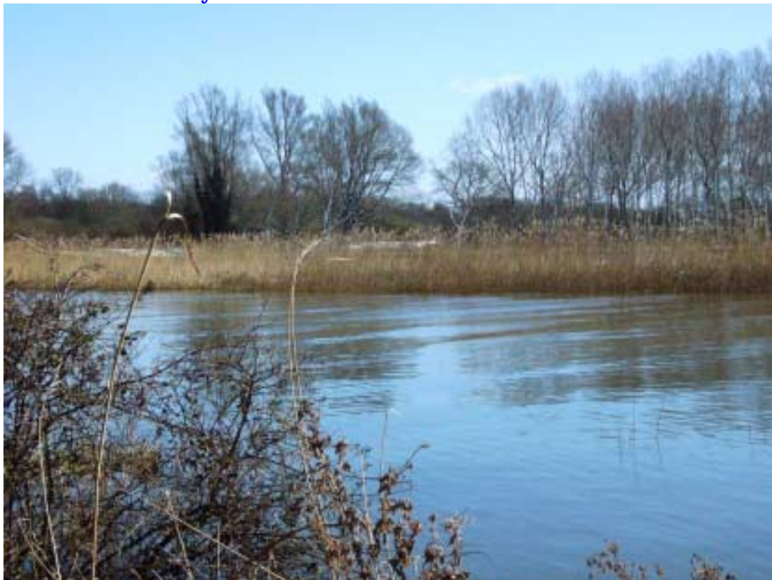
Photo: River Waveney at Beccles Marshes