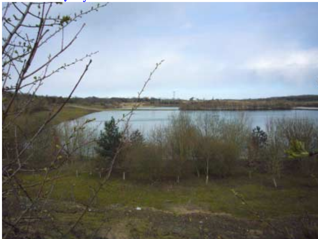
Photo: Flixton Quarry