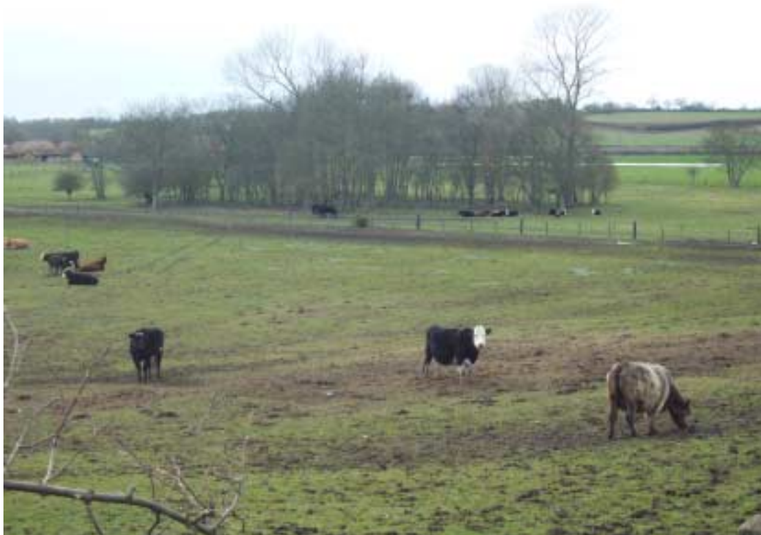
Photo: unfenced flood-plain woodland at Flixton damaged by cattle poaching