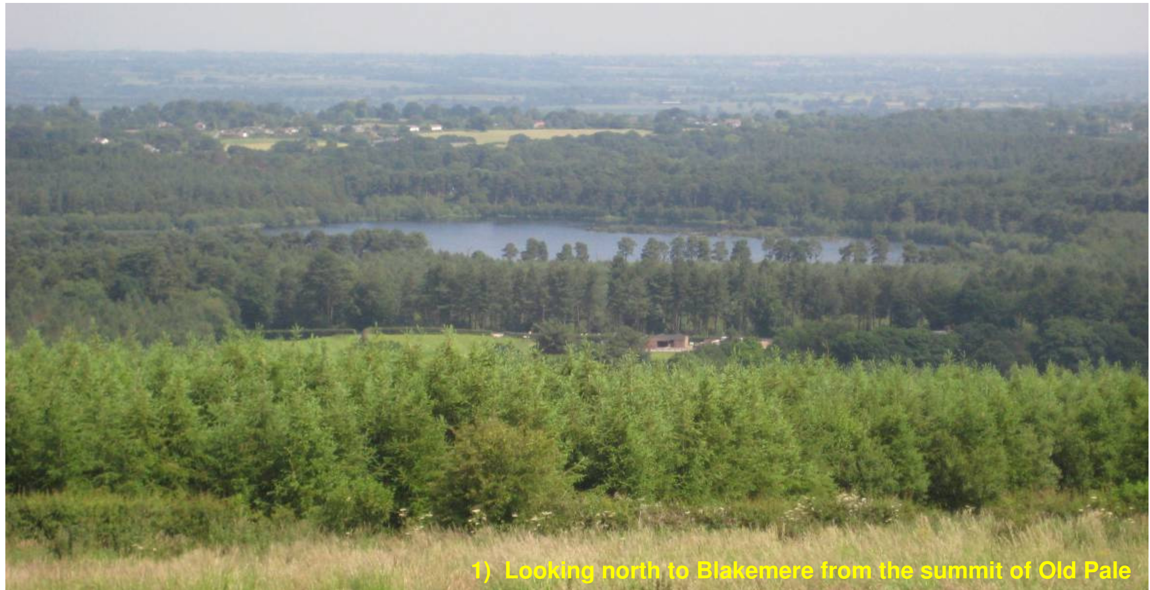
1) Looking north to Blakemere from the summit of Old Pale