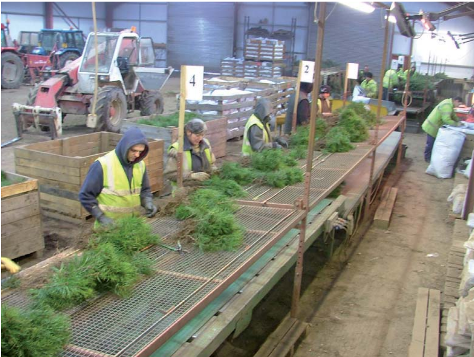
ScotsPine being graded in the foreground, Sitka Spruce at the farthest bench