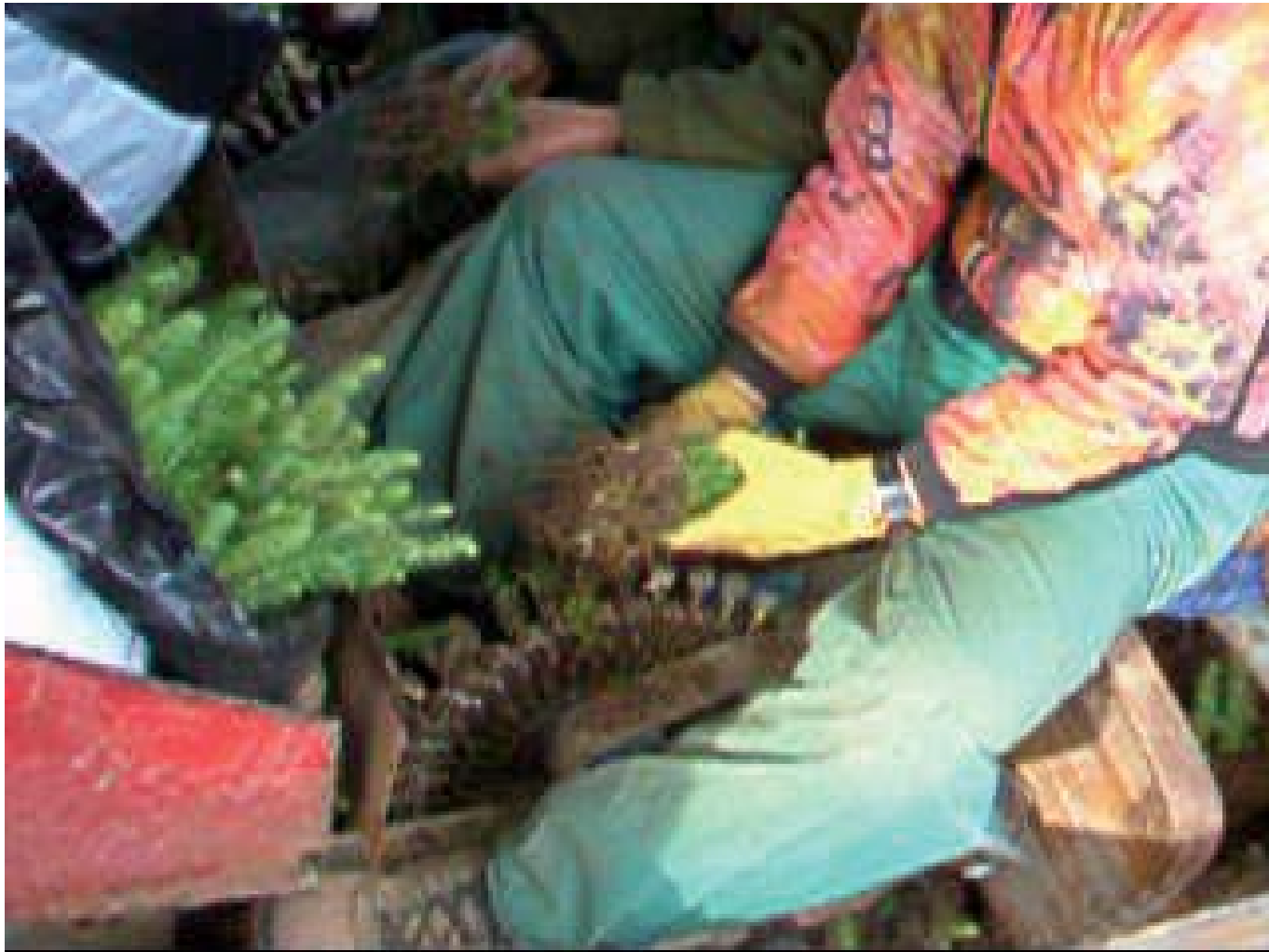
Lining Seed Orchard sourced Sitka Seedlings from the Seed Beds