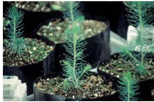
Sow stock plants