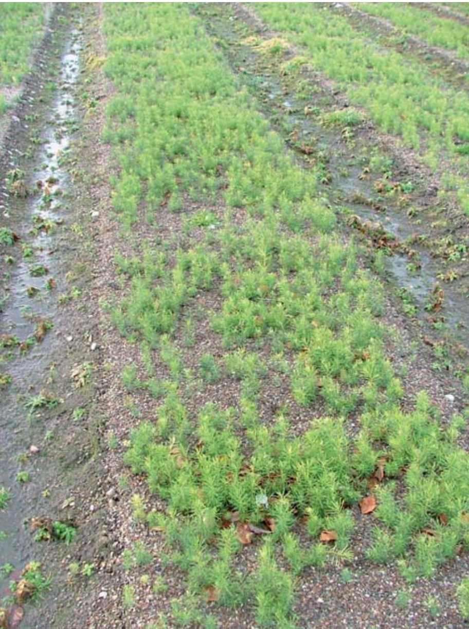
Seedbeds, Sitka densely sown for transplanting on the left, and Douglas for undercuts on the right.