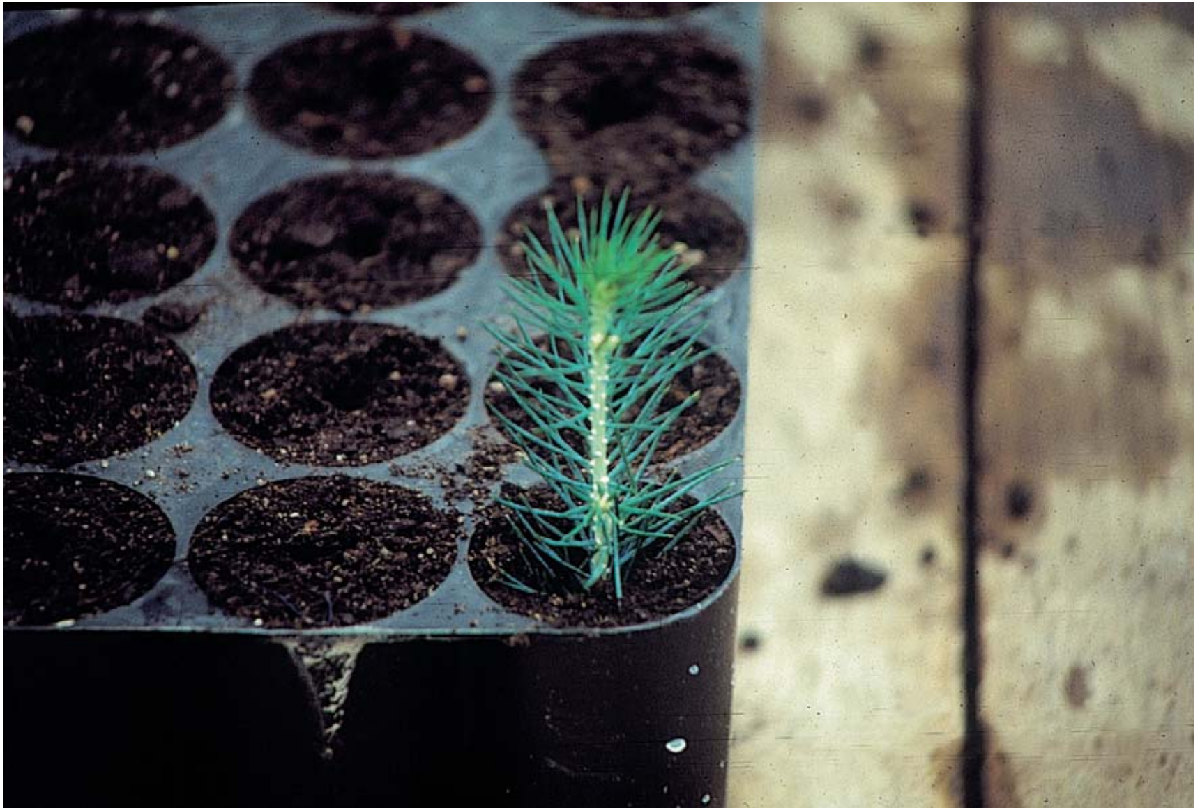
“Elite” Sitka cutting struck into cell