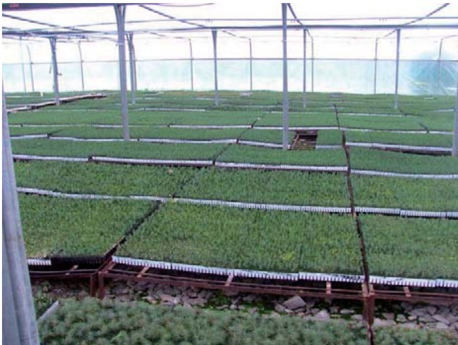
Improved Sitka in Mini-plugs