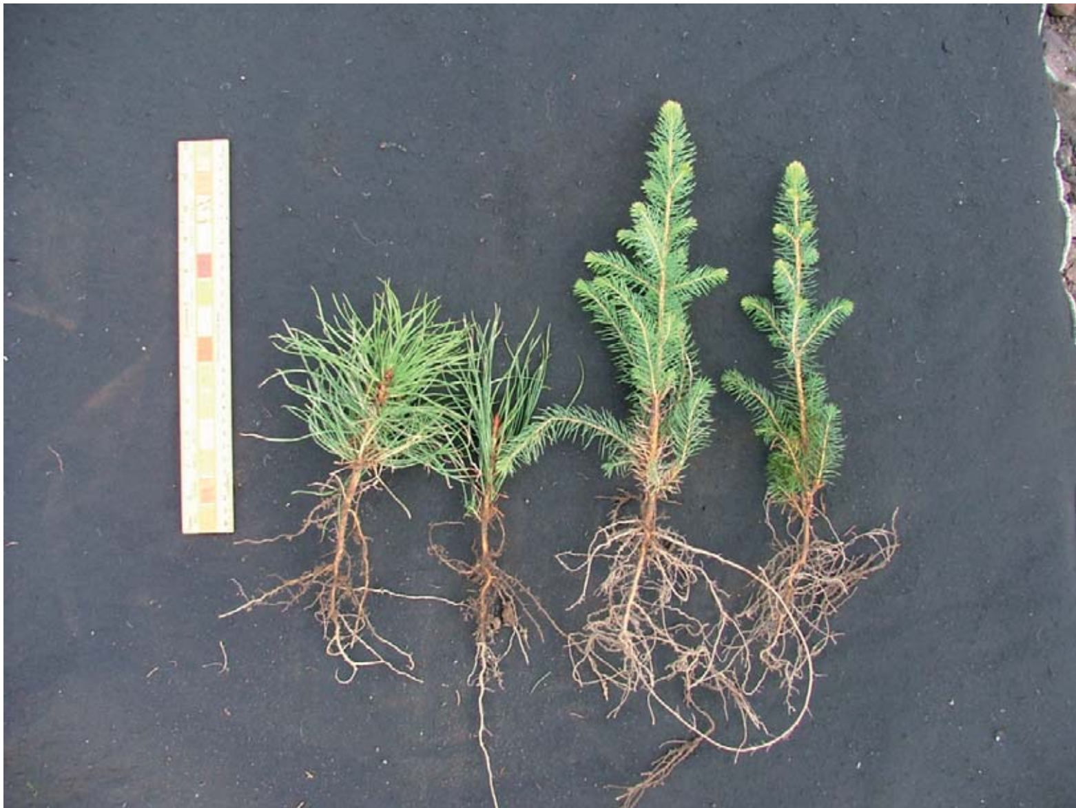
2 year old Undercuts