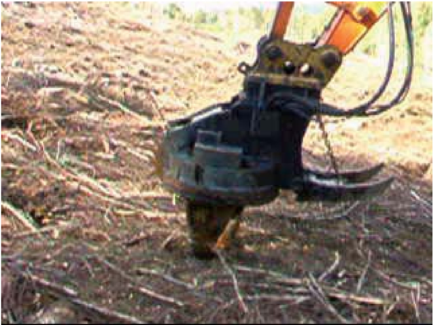
Rotary Spot Cultivation