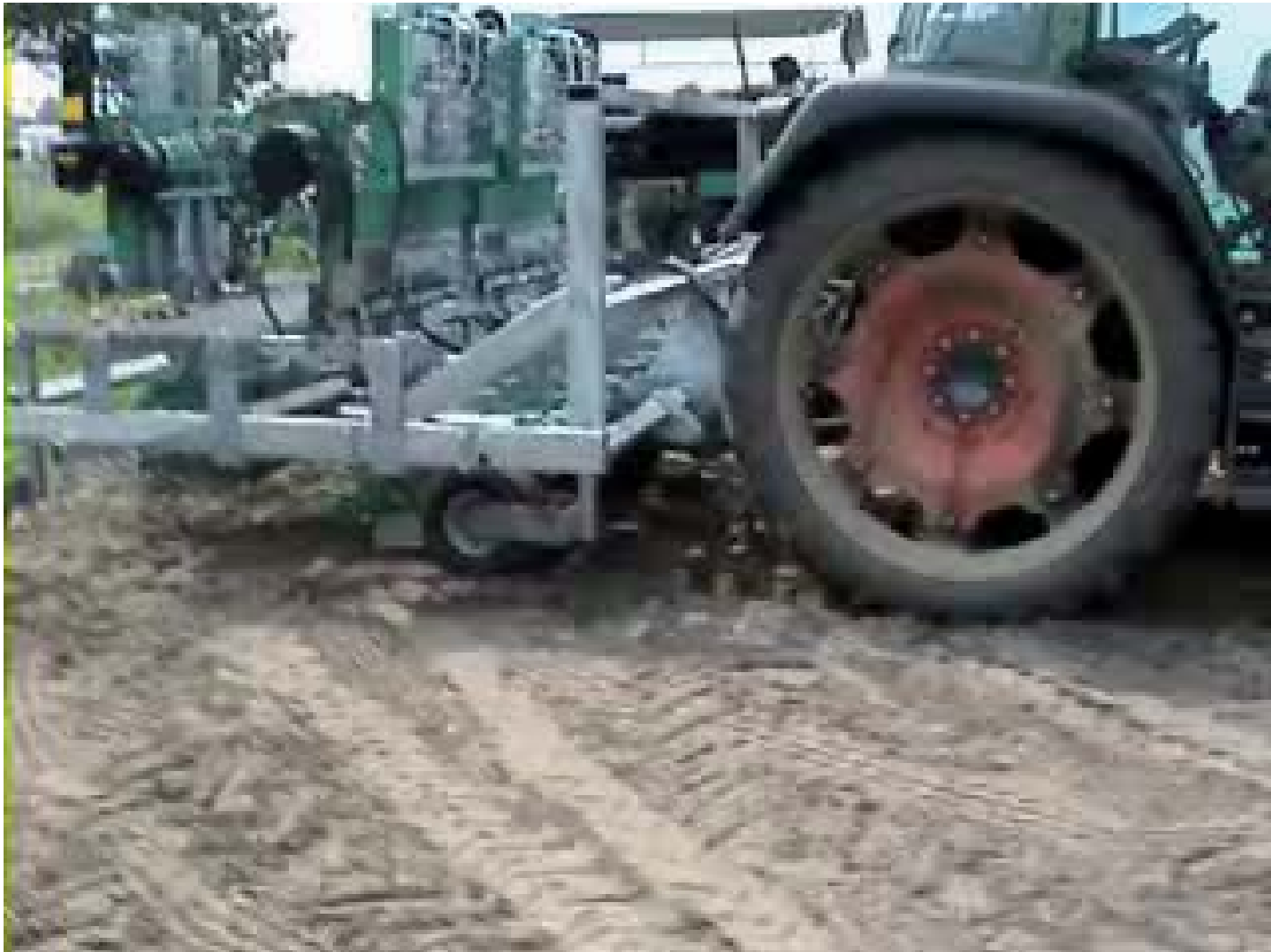
Lannen automatic transplanter