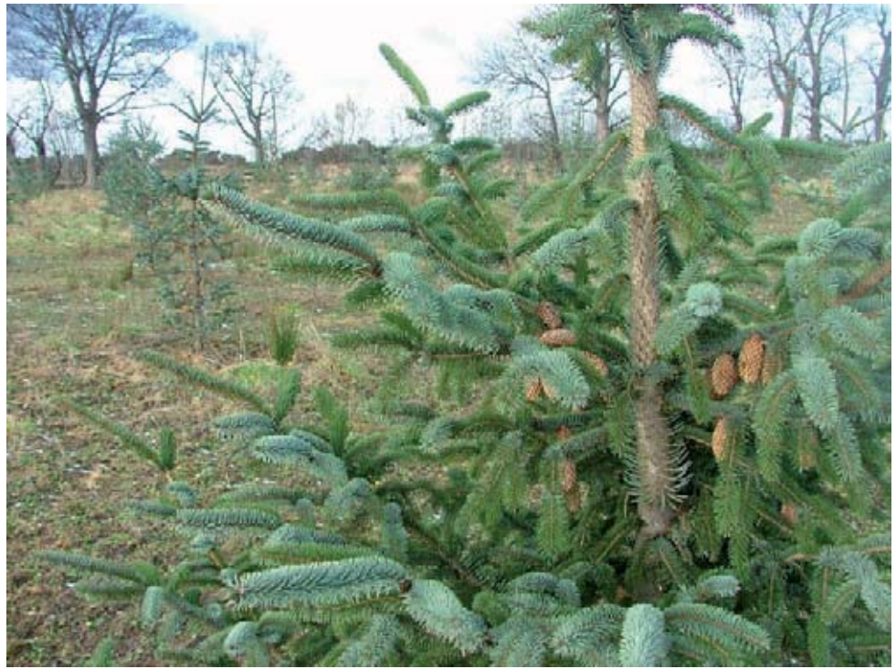
The Andy Currie Seed Orchard