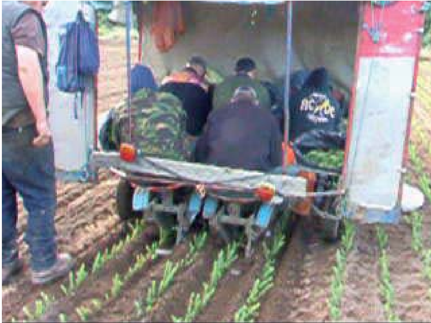
Lining Seed Orchard sourced Sitka Seedlings from the Seed Beds