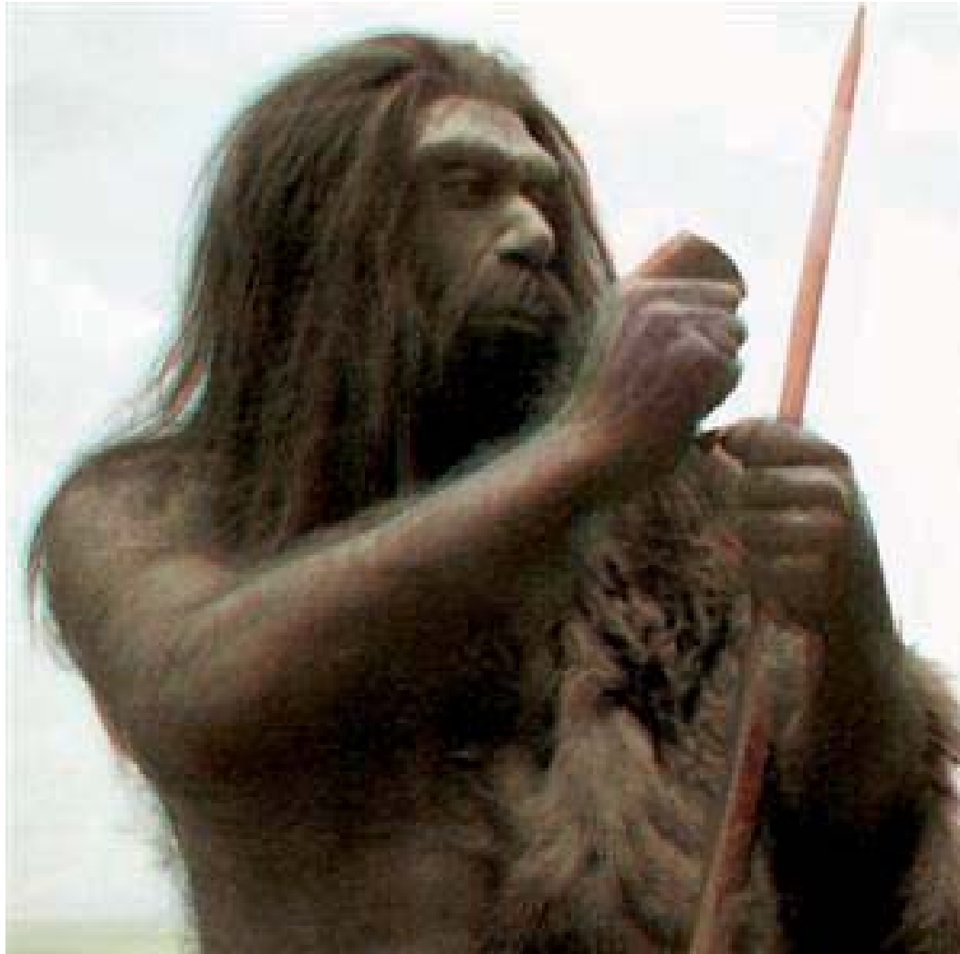
Hunter Gatherer- Neanderthal Man