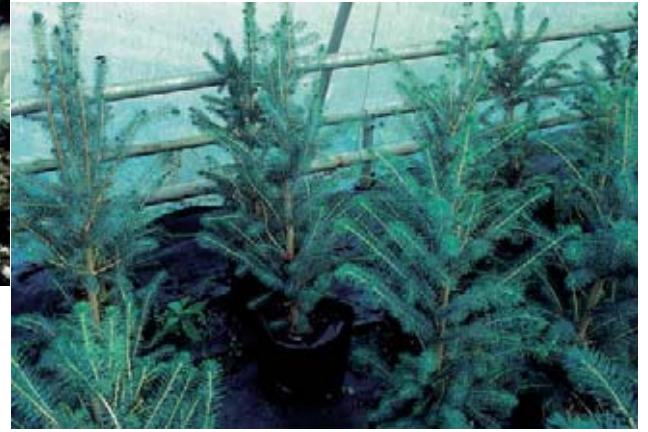
Nurture for 2 years