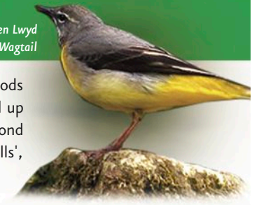
Siglen Lwyd Grey Wagtail

The Forestry Commission began planting these woods after the First World War as the war effort had used up Britain's timber. This continued through the Second World War with Land Army Girls, known as 'Timber Jills', helping out. Much of the work was done by hand with horses pulling out the logs.