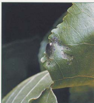
Damage to poplar leaves caused by Phyloocta spp.