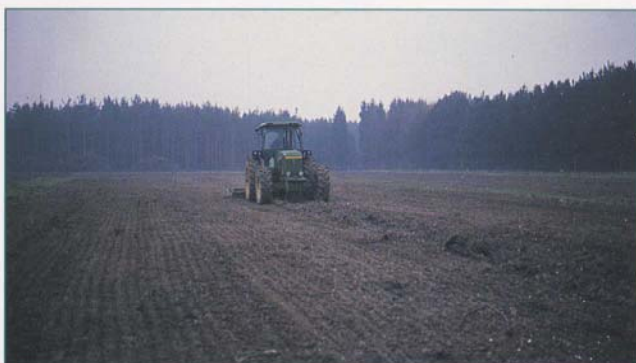
Power-harrowing prior to planting

At the end of the first growing season failures were replaced and all trees stumped back to 10 cm above ground level to encourage the stools to become multi-stemmed. Harvesting is planned to follow a standard 3-year cutting cycle, so that data will be readily comparable between sites and with data from other research.