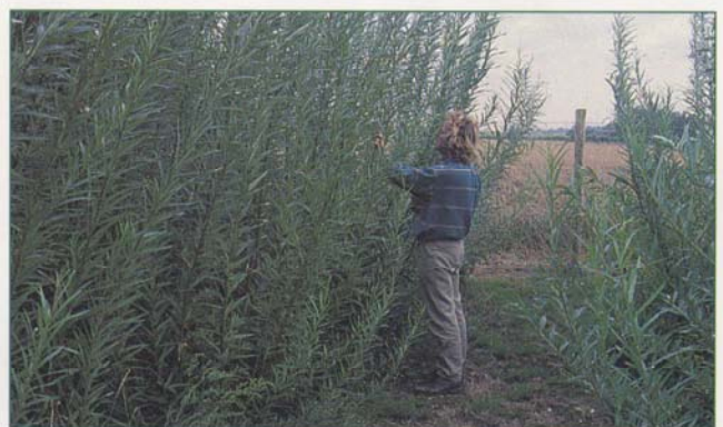
Willow coppice 6 months after cutting back