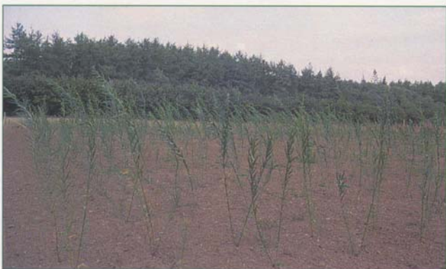
Willow coppice 6 months after planting as unrooted cuttings