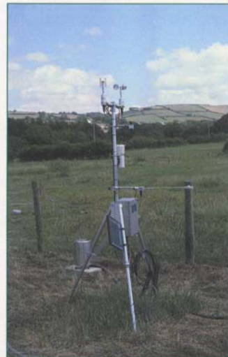
Meteorological data being collected at an Intensive site