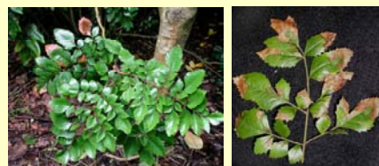
Figure(s) 4. Gevuina avellana with leaf blight caused by Phytophthora kernoviae in Cornwall