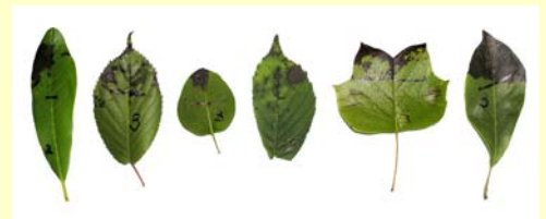
Figure 2. Necrotic leaf area of inoculated plants after 8 days. Black line shows the limit of dipped region