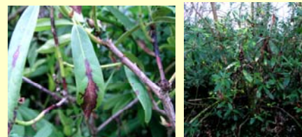
Figure(s) 5. Rhododendron infected with Phytophthora kernoviae in Cornwall