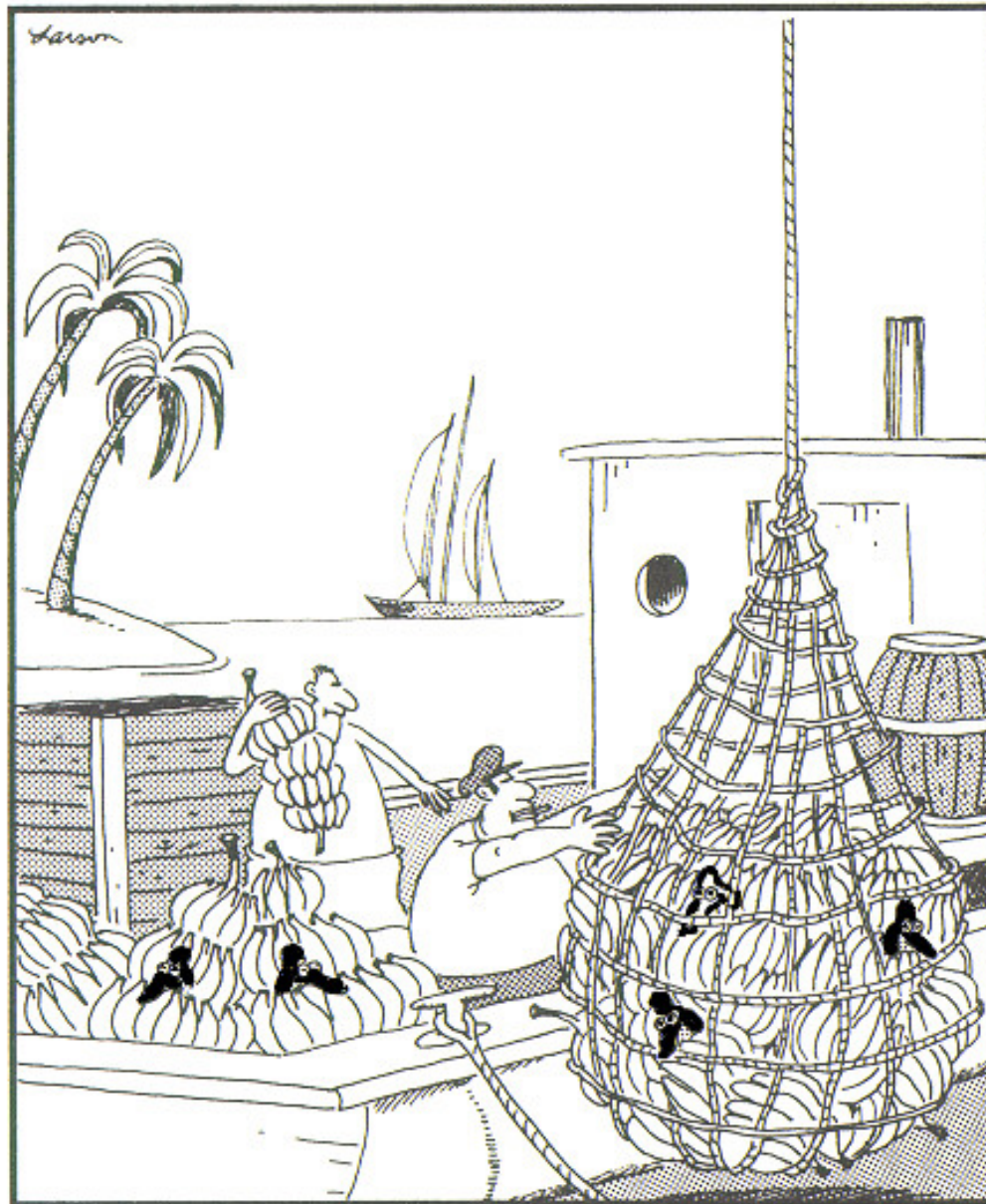
How Poodles Came to America