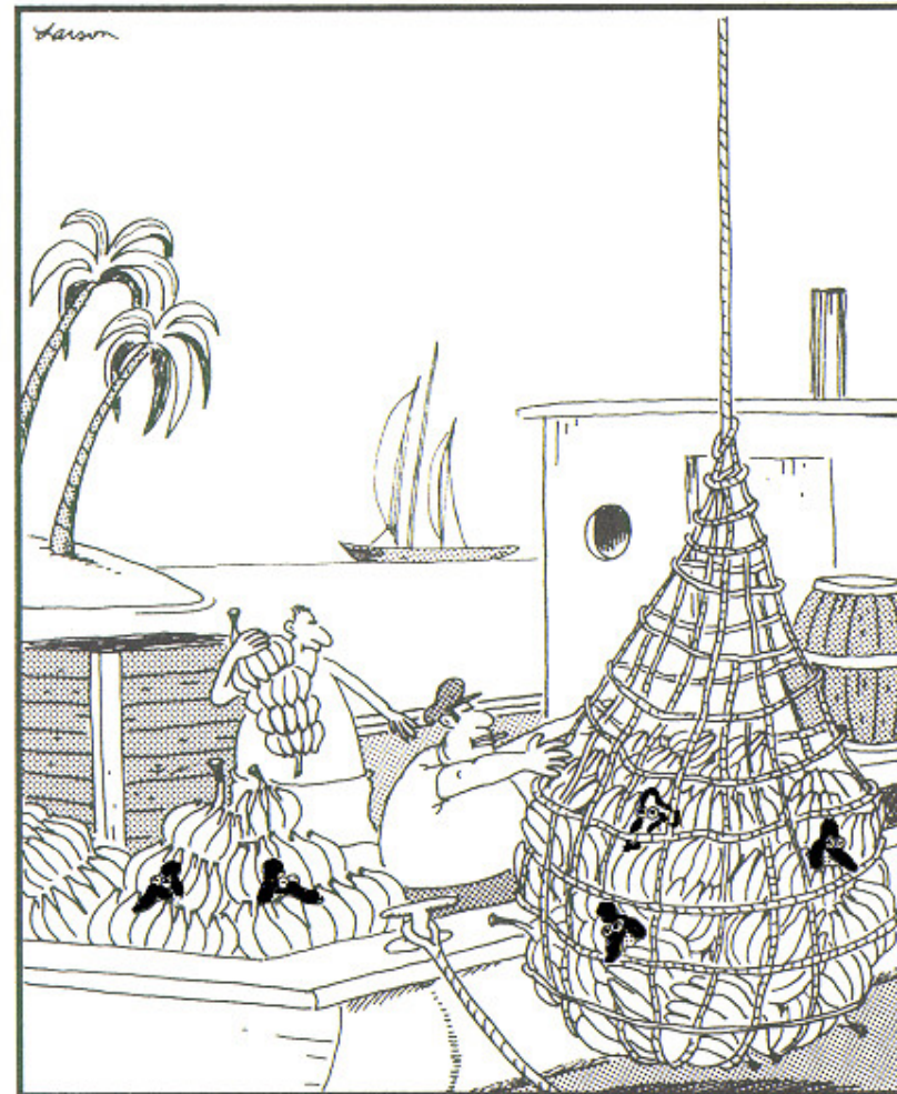
How Poodles Came to America