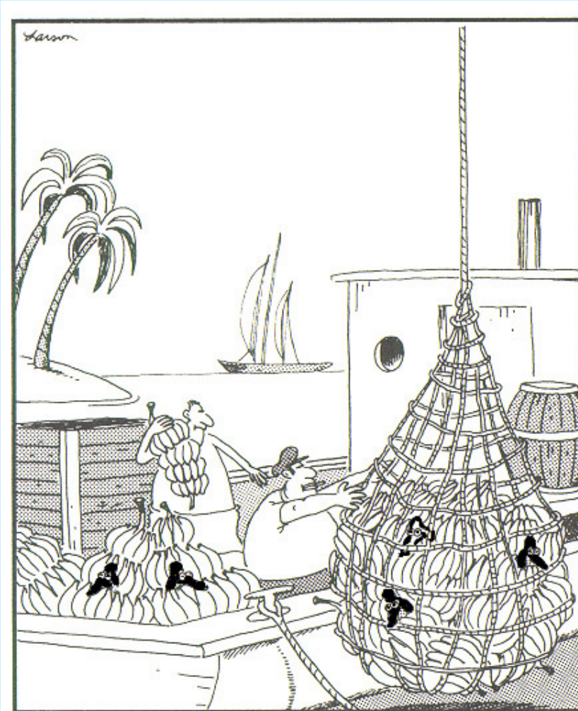
How Poodles Came to America