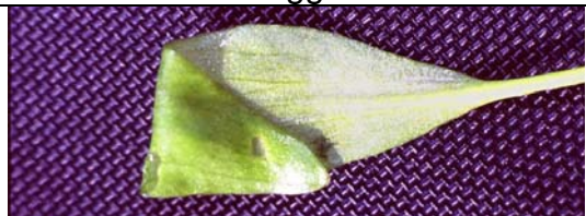
Figure 1: Leaf folded around a newt's egg.