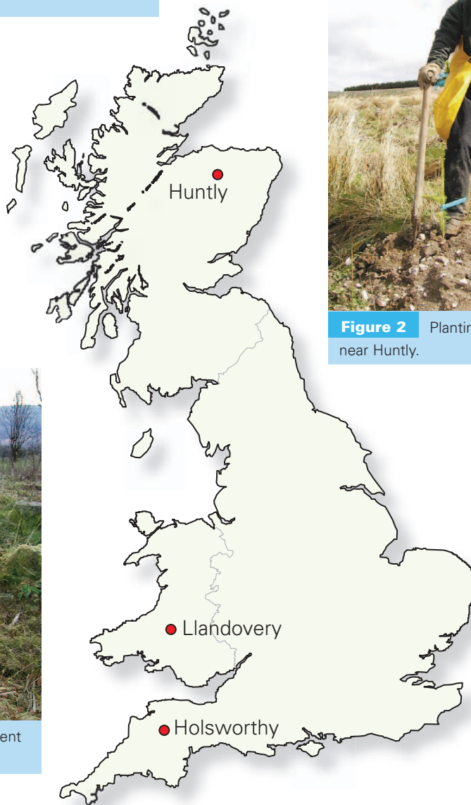
Figure 1 Location of the three trials, planted in spring 2005 at Huntly (north Scotland), Llandoverly (south Wales) and Holsworthy (north Devon).