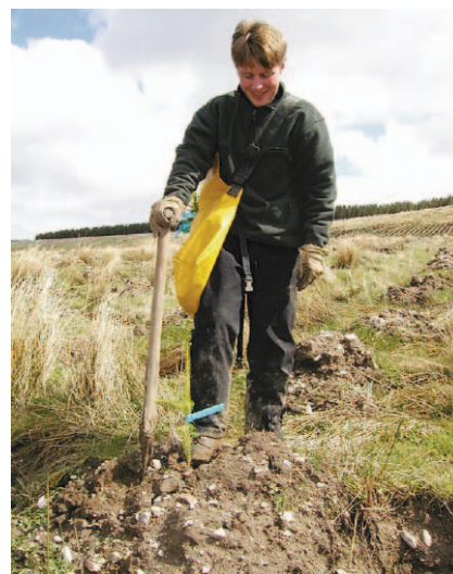
Figure 2 Planting on the upland site near Huntly.