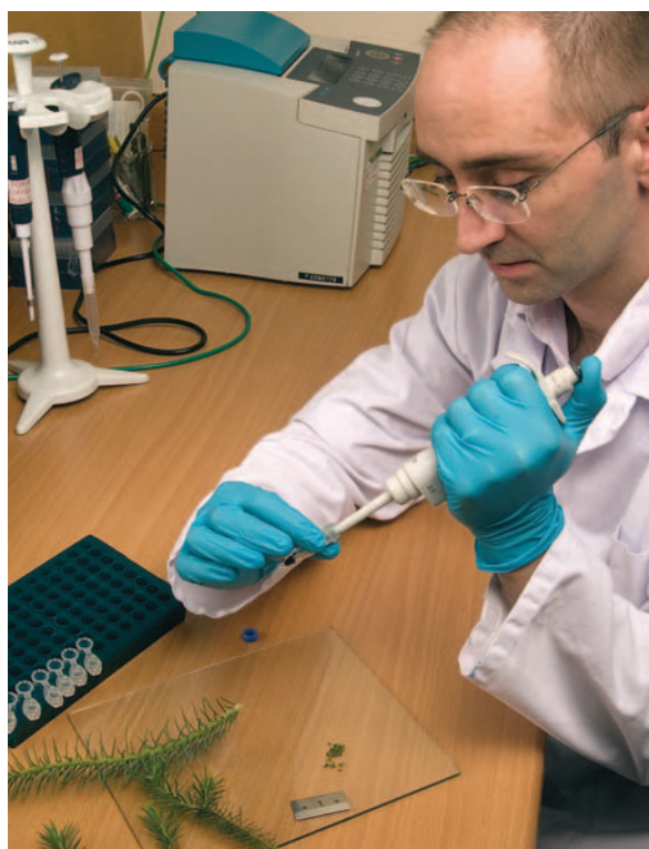
Figure 5 Preparing Sitka spruce needles for DNA extraction prior to PCR. FR scientists hope to amplify 200 microsatellite markers and position them on a framework map.

FR is searching for 200 microsatellites to create the framework map (Figure 5). Once this major step is completed, other classes of marker will be used to increase the marker density and ensure there are no gaps on the map. Microsatellite markers are often cross-species transferable, thereby allowing maps with other species to be combined. The other classes of markers, known as dominant markers (e.g. AFLPs and ISSRs) are not as informative as microsatellites and cannot be transferred across species, but can be generated in greater numbers and are less costly to develop. There are also plans to explore the use of a further type of marker known as single nucleotide polymorphisms (SNPs).