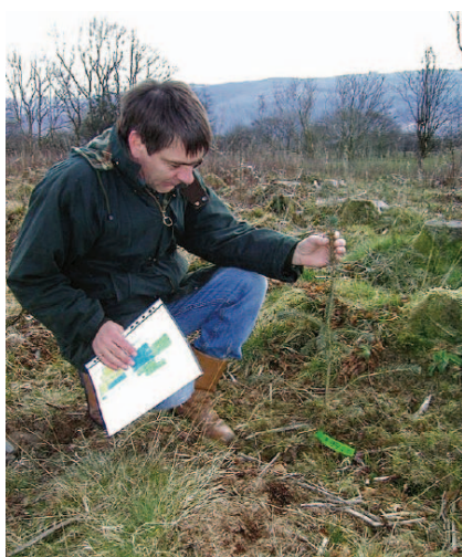
Figure 3 Successful establishment on the mid-ranged Llandoverly site.