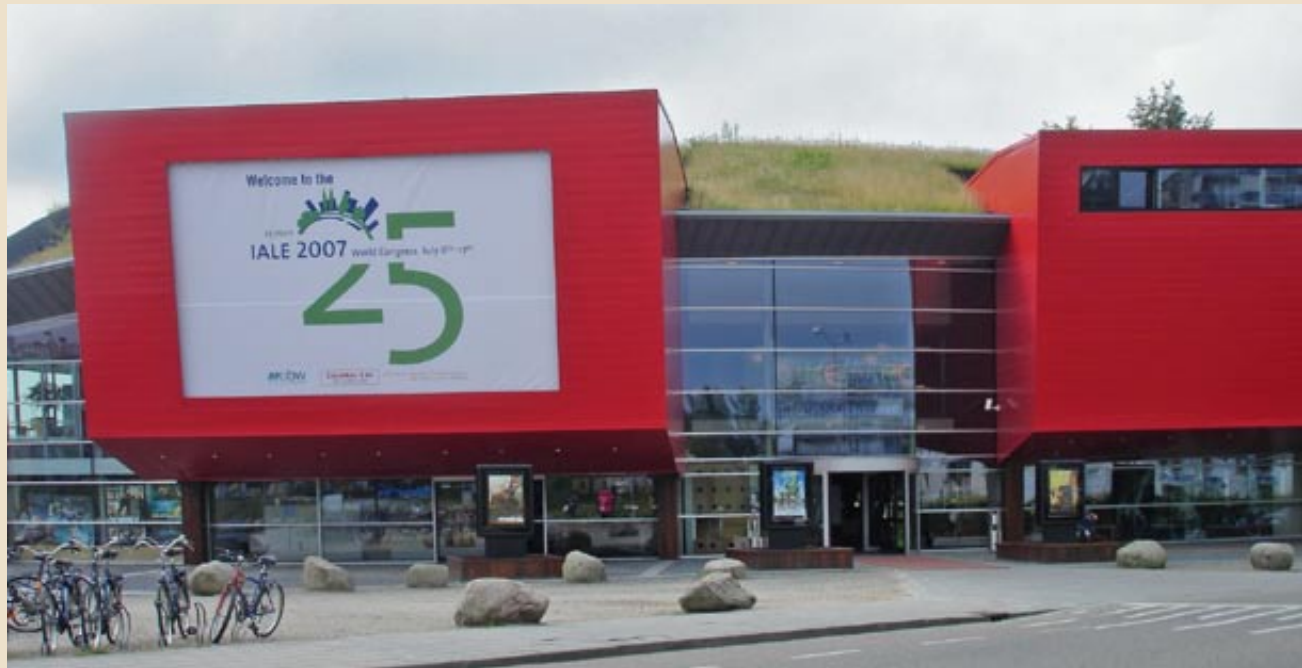
Motorway bank cinema in Holland