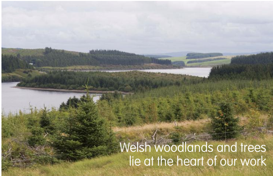
Welsh woodlands and trees lie at the heart of our work

Woodlands for Wales has five themes: the first theme, 'Welsh woodlands and trees', lies at the heart of our work and of course is fundamental to everything we do. The remaining four themes are: