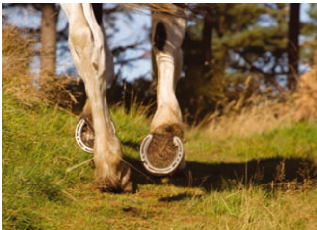
Figure 11 Horses can cause damage to soil and vegetation.

Horse riding can affect wildlife habitat in a number of ways, including soil compaction, erosion, vegetation damage, increased trail depth and width, and sediment movement (Figure 11). Trampling can compact the soil and damage surface litter, lichens and mosses (Newsome et al. , 2002) and reduce populations of invertebrates (Littlemore and Barlow, 2005). Littlemore and Barlow state that 'In British woodlands, heavy trampling can severely reduce the population densities of soil and litter dwelling invertebrates by up to 89% in path centres and by 57% at path margins when compared to undisturbed soil profiles' (2005, p. 277–278). Landsberg, Logan and Shorthouse (2001) cite their own (Canberra Nature Park, Australia) and other studies (Summer, 1980, 1986) where they identify the terrain most vulnerable to trampling to include colluvial slopes, moraine sideslopes, wet bogs and alpine areas. Moreover, damage to trails is compounded by the use of shortcuts instead of following trails with switchbacks, or veering off the trail to avoid obstructions such as fallen trees (Landsberg, Logan and Shorthouse, 2001). Removal of vegetation can be greater when horses are going downhill (Weaver and Dale, 1978) but the level of damage is dependent on other factors such as soil type, climate, sensitivity of vegetation and management measures currently in place (Newsome, Cole and Marion, 2004).