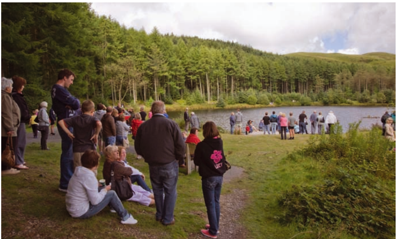
Figure 17 Red kite viewing is increasingly popular.

Wildlife watching – sometimes described as non-consumptive use of wildlife, wildlife tourism or as part of ecotourism – is increasingly popular (Figure 17) and can raise considerable revenue. Between 1989 and 1995 the 'ecotourism' industry grew worldwide from US $60 billion to $175 billion (Karp and Guevara, 2011) and is continuing to expand. Rodger, Moore and Newsome (2010) report that between 20 and 40% of international tourism involves some form of wildlife viewing. People expect to see wildlife (Lemelin and Wiersma, 2007). While participants in wildlife watching will have different interests and preferences (Vaske, Hardesty and Sikorowski, 2003), wildlife watching experiences can include unguided encounters in natural areas, specialised wildlife tours, managed local wildlife attractions and research, and conservation or education