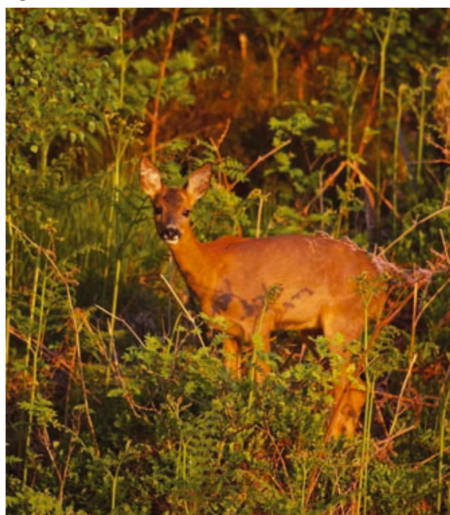
Figure 6 Roe deer maintain their behaviour when disturbed.

Although immediate/short-term behaviour change may be apparent, this limited available evidence shows little or no long-term negative impacts upon UK forest mammals following 'flight' caused by walking in woodlands.