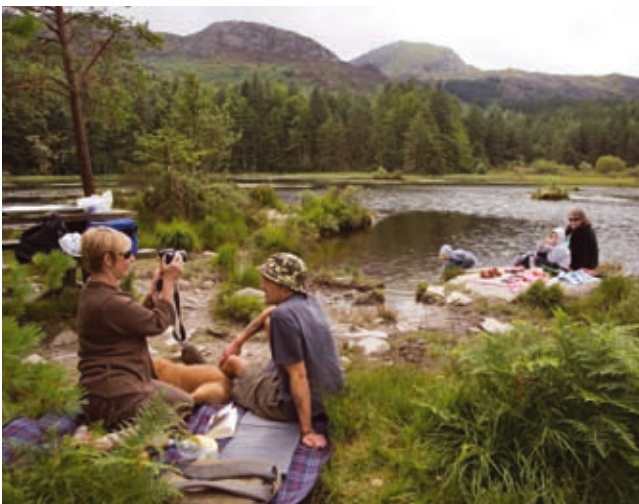
Figure 20 Picnicking beside Llyn Llewelyn, Beddgelert forest.