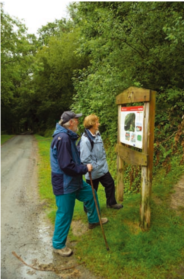
Figure 26 Visitors read the interpretation panel at Nash Carpark, Presteigne.

communicating with horse riders, who will perhaps find it difficult to stop at such places. Interpretive signs are not always effective. For example, Buckley (2004) reports how Pojar et al. (1975) found that even illuminated and animated warning signs did not reduce roadkill of deer: drivers only slowed down when they saw dead deer carcasses on the roadside.