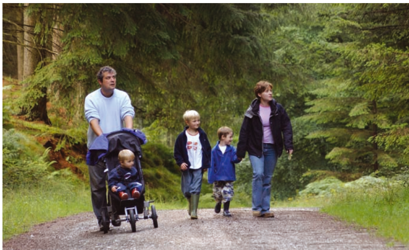
Figure 2 Forest roads are ideal for family walks.

Walking is the most frequent and popular recreational activity conducted in natural areas such as forests and woods (Figure 2). It is certainly the most widely reported and recorded activity on land managed by the Forestry Commission (Watson and Ward, 2010). Hiking and walking have the potential, however, to disturb wildlife in a