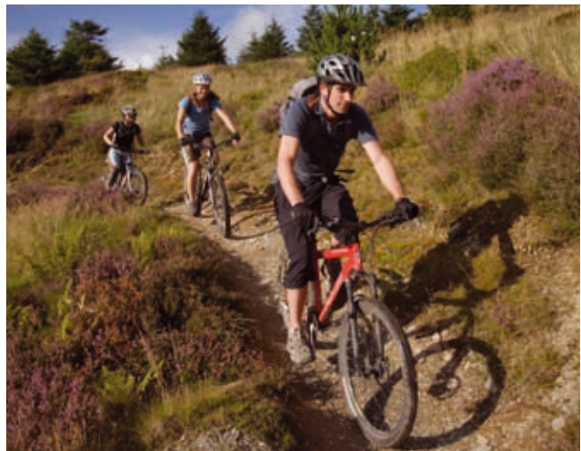
Figure 8 Mountain biking is an increasingly popular activity.

Impacts from mountain biking can be classified broadly into two categories: (i) habitat change (trampling and erosion); and (ii) flight and behaviour change (Lathrop, 2003). Some literature also suggests that cycling can cause wildlife mortality.