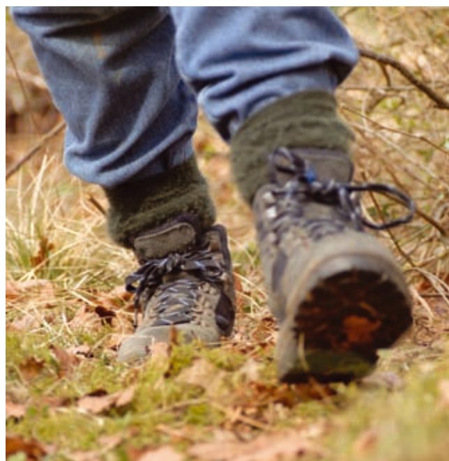
Figure 4 Impact can have a serious effect on vegetation.

Recent studies have confirmed earlier findings (e.g. Bayfield, 1971, 1973) that trail characteristics can have a substantial affect on disturbance, for example trail 'roughness can cause hikers to widen trails by seeking out smoother trailside hiking surfaces' (Wimpey and Marion, 2010, p.2035). However, impacts seemingly decrease with distance away from trails. Dale and Weaver (1974) noted that vegetation more than 2 m from a trail edge is not often affected.