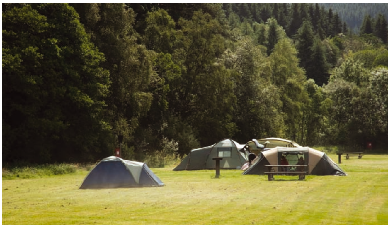
Figure 22 Kielder Campsite screened by trees.

Knight and Temple (1995) identify three main categories of access restriction aimed at reducing wildlife disturbance by recreational activities: buffer zones, time restrictions and visual screens (Figure 22). Establishing 'buffer zones' is a common method, the range of which can be derived from flight response and distance research (e.g. 'alert