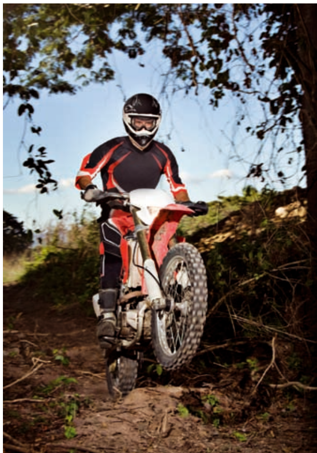
Figure 13 Trail biking and other vehicle related activities can cause serious disturbance.

Buckley (2004) provides a useful review on impacts including compaction, erosion and trampling of soil, vegetation and fauna, transportation of weeds, and impacts on other wildlife through collisions and noise. He divides OHV impacts between plants/vegetation and vertebrates/invertebrates. Although some vegetation types