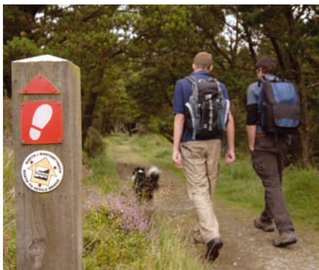
Figure 3 Dogs can increase the level of disturbance.

Walking in forests and other natural areas can potentially disturb wildlife, with three general categories of effect. These are: (i) habitat change; (ii) 'flight'; and (iii) the introduction of invasive species, pests or diseases.