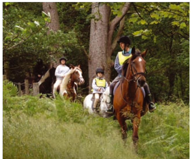
Figure 12 The risk of horses spreading non-native plants along forest trails is minimal.

Gower (2008) believes that horses are not a significant vector for invasive species as germination success on forest trails is very low. Campbell and Gibson (2001, p. 23) conclude that 'the emigration of exotic species via horse dung does not pose an immediate threat to the plant communities adjacent to trails in these forest systems'. Torn et al. (2009, p. 235) note, similarly, that 'alien species may be introduced to natural forests through recreational horse riding', but that 'In practice, the risk of [these] alien species to the biodiversity of natural forests may be relatively small'.