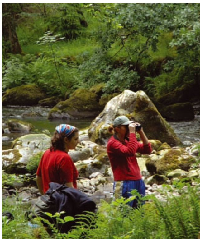
Figure 19 Bird watching can have positive and negative impacts.

resources to attain expert knowledge and skill. The act of birdwatching can have positive or negative impacts on birds. As Sekercioğlu (2002, p. 282) has pointed out, birdwatchers represent an 'environmentally conscious segment of ecotourism' (see also Bell, Marzano and Podied, 2010). However, there are incidences where recording or photographing birds can have harmful effects, particularly in competitive birdwatching with the importance of birding 'lists' (e.g. local patch list, county list, UK list) and 'twitching' (e.g. those who travel at short notice to see a rare bird). These can impact on rare and vulnerable