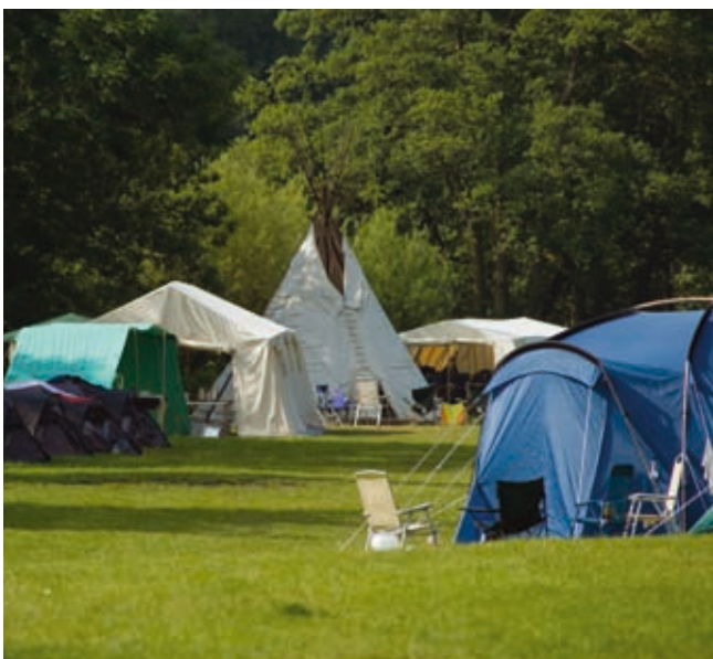
Figure 15 Intensive camping can cause habitat change.

The main forms of impact include habitat change and flight and behaviour change (Cole and Monz, 2003; Leung and Marion, 2004; Littlemore and Barlow, 2005).