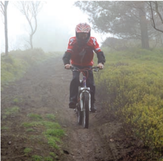
Figure 9 Mountain biking can cause trail widening and vegetation loss.