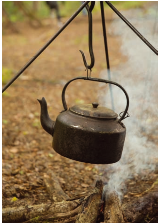
Figure 16 Camp fires can change habitats and soil structure.

Johnson and Clark (2000) discuss the impacts of camping in the New Forest, UK, where wild camping in the first half of the 20th century resulted in considerable environmental damage leading to regulations where camping was restricted to specified sites. The New Forest contains significant areas of semi-natural woodland. Despite the reduction in campsites and pitches, disturbance from campers have been documented. The authors cite a case study 'Hollands Wood' where damages to the environment over a 28-year period were recorded including: (1) 84% of the mature trees lost, reducing canopy cover by 50%; (2) 76% of the site classified as heavily disturbed ground; (3) 16% covered by roads, tracks and buildings; (4) significant