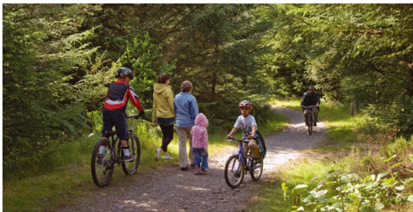
Figure 1 Forest trails are suitable for various recreational activities.

Management recommendations permeate the literature; however, only a limited literature exists which directly or systematically addresses the management options available. Evidence relating to how recreationists understand or perceive their own and others' impacts on wildlife is also very sparse. We discuss these areas of the literature in the sections on Recreational users' perspectives (p.22) and Managing impacts (p.24).