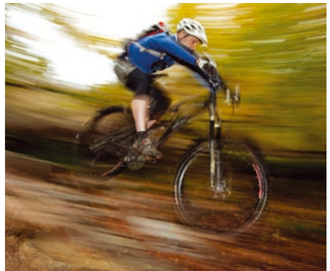
Figure 10 High speed riding is a danger to wildlife and humans.

Some literature reports little or no impact on wildlife by mountain bikers. For example, Lathrop (2003) cites research by Stake (2000) who was studying the golden cheeked warbler ( Dendroica chrysoparia ) at Fort Hood, Texas, before the introduction of mountain biking to the area. This study reported no impacts from mountain biking on territory density, return rates or age structure of the bird population.