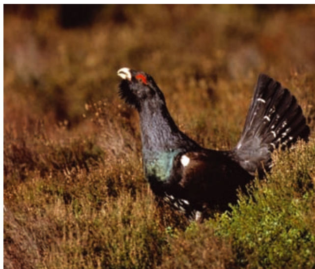
Figure 5 Capercaillie are sensitive to recreational activities.

Studies relating to other birds associated with woodlands in the UK include black grouse ( Tetrao tetrix ) and capercaillie ( Tetrao urogallus ) (Figure 5). Baines and Richardson (2007, p. 56), for example, report that 'The disturbance regimes imposed had no discernible impact upon black grouse population dynamics' (although one study revealed a considerable impact of skiing on black grouse populations in the European Alps (Patthey et al. , 2008). An earlier study of red grouse (Picozzi, 1971) similarly showed no negative breeding impact, stating 'Grouse bred no worse on study areas on moors where people had unrestricted access, and Grouse bags showed no evidence of a decline associated with public access agreements' (p. 211). Newton, Robinson and Yalden (1981) investigated the potential impacts of recreational walkers on merlin ( Falco columbarius ) in the Peak District National Park. Their conclusion was that it was 'unlikely' to have caused the 'sharp decline in merlins during the 1950s' (p. 232), but that it could possibly slow recolonisation. Other studies of merlin (e.g. Meek, 1988) similarly suggest little negative impact by recreation, instead focusing on general habitat degradation by agriculture and pollution as the most likely causes of decline. In contrast, studies of capercaillie suggest a negative impact