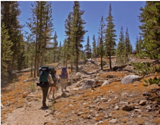
Figure 7 Hiking can increase the spread of disease.

Jules et al. (2002) also identify human footfall as a vector for disease spread, although they identify vehicular spread as much more significant. Turton (2005) identifies the spread of weeds and soil pathogens by walkers and vehicles along forest paths as a key environmental impact in the tropical forests of Queensland, and recommends the 'removal of mud and soils from vehicle tyres and hiking boots before entering pathogen-free catchments' (p. 140) as a management strategy.