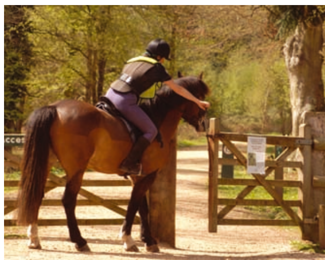
Figure 23 Horse rider entering the Wilverley enclosure, New Forest.

Some authors (e.g. Newsome et al. , 2002) believe that restriction or rationing recreational use in vulnerable areas is a more effective management tool than 'education'.