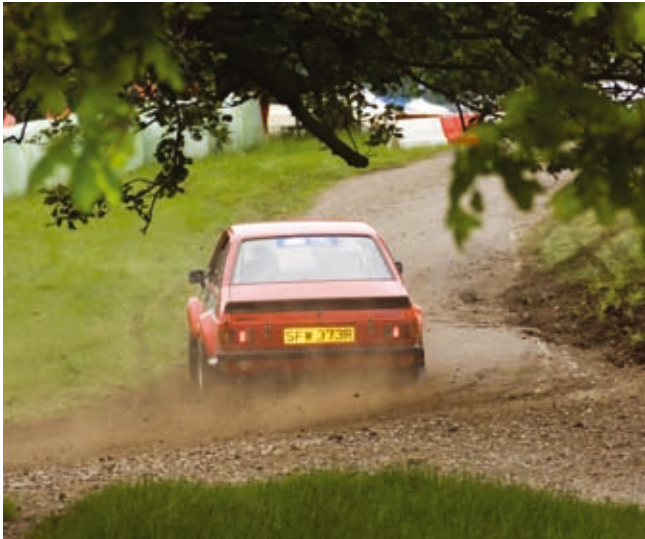
Figure 14 Car rallies are a source of disturbance to birds.