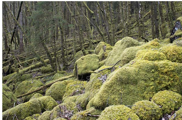
Good wildcat den habitat amongst mossy boulders