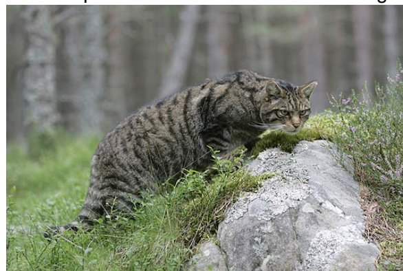
Wildcat searching for food

This disturbance can be prevented if normal good forest practice is followed. Wildcat range over very large areas and felling and replanting which conforms to best practice as set out in the UK Forestry Standard should not constitute an offence. In fact, best practice management could increase food supply in the short to medium term, as well as providing for longer term variety and habitat quality. However, the impact of such changes should be considered as part of the woodland planning process.