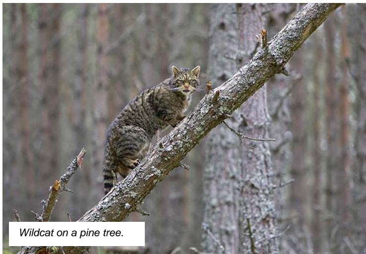
Wildcat on a pine tree.

Importantly, accidental damage or destruction of den sites, as well as that which is done deliberately or recklessly, could be an offence. Remember that dens are protected at all times even when no wildcats are present. However, the time when disturbance of a den will be most detrimental is during the breeding season, when female wildcat are pregnant or have dependent kittens.