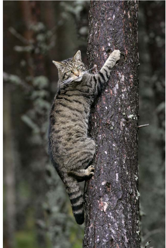
Photo of wildcat showing characteristic blunt tail tip, tail bands and stripes and spots on coat

Note that one output of a specialist wildcat survey should be a report which is sufficient to allow decisions on forest planning to be taken and to inform a licence application if one is necessary.