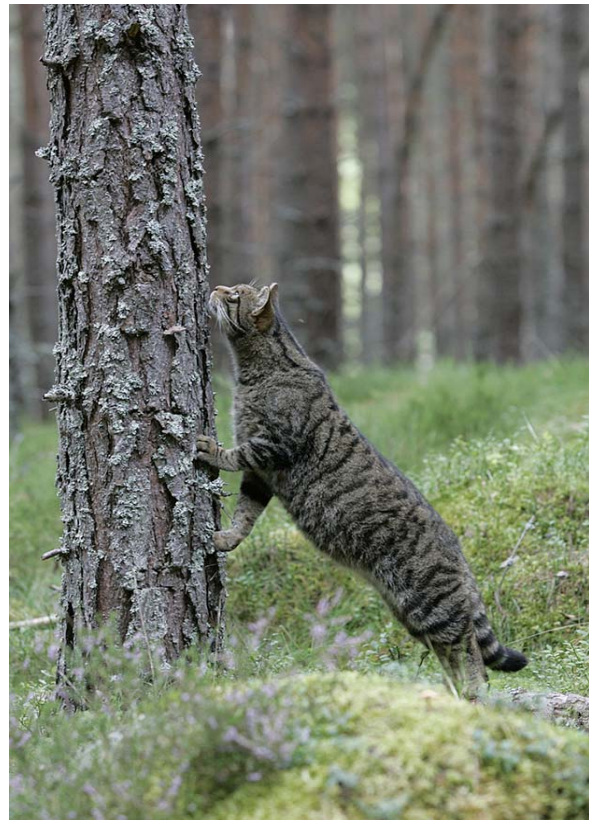
Wildcat showing typical pelage characteristics

Record any incidents and the action taken when wildcat or their dens are encountered during operations.