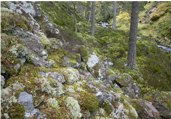
Good wildcat den habitat