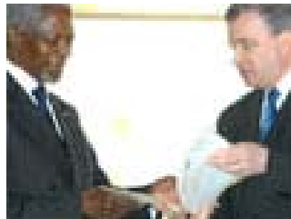
Figure 2. Kyoto Ratification -The UN Secretary General Kofi Annan receives Russia's instrument of ratification. Allowing the Kyoto Protocol to enter into force in early 2005.

In response to the threat of climate change, the Kyoto Protocol was adopted in December 1997. Under the Protocol, industrialised countries have a legally binding commitment to reduce their collective greenhouse gas emissions by at least 5% compared to 1990 levels by the period 2008-2012. Russia ratified the Kyoto Protocol on 18 th November 2004 and as a result it came into force on February 16 th 2005.