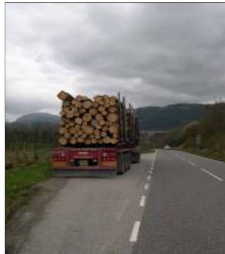
Figure 5. Timber transported by lorry

Wood has a negative carbon intensity because while a tree is growing, carbon is sequestered and stored, meaning that CO 2 is taken from the atmosphere, rather than being emitted into it during production of the material. It should be noted that emissions reductions resulting from the use of timber in construction will only be achieved if the timber is taken from a sustainably managed source.