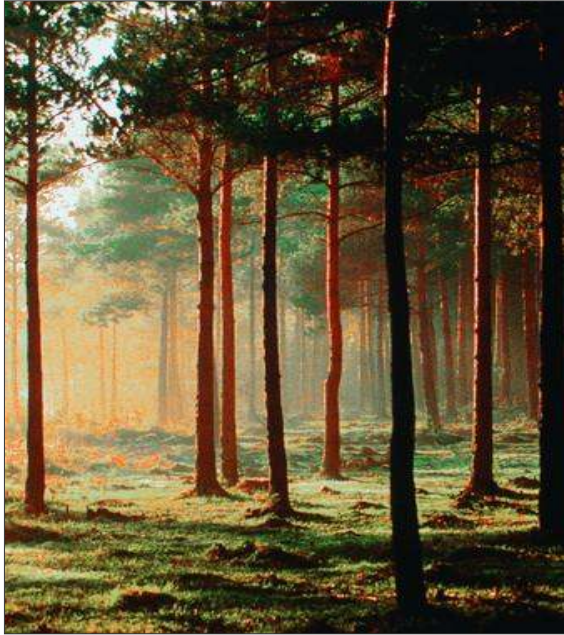
Figure 4. As trees grow, they sequester carbon from the atmosphere giving them a negative carbon intensity.

For all building types that have been assessed as part of this study, GHG emissions associated with the embodied energy of construction materials are lower if the timber content is increased. This study has demonstrated that, indicatively, it is possible to achieve up to an 86% reduction in GHG emissions by increasing the amount of timber specified in buildings.