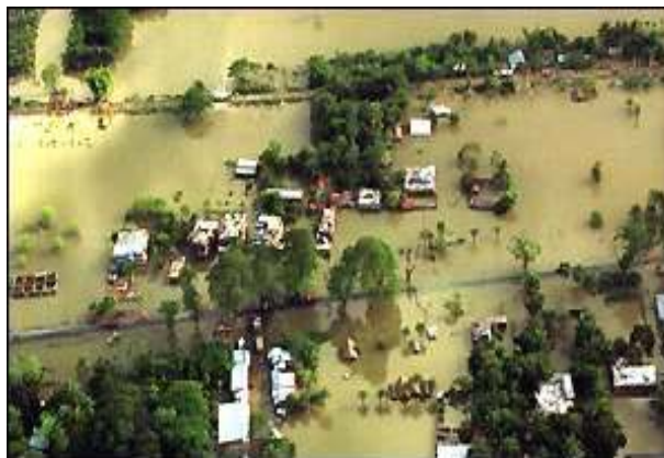
Figure 1. Flooding in Bangladesh

Climate change presents a serious challenge for responsible business leaders in the 21 st century. Most scientists now agree that rising atmospheric concentrations of greenhouse gases (GHGs), particularly carbon dioxide (CO 2 ), threaten to have severe impacts on food production, natural ecosystems and human health over the next 100 years. Industrialised and rapidly industrialising countries are the main sources of greenhouse gases. However, the greatest impacts will be felt by people in developing countries, particularly those in low lying coastal regions and marginal agricultural areas.