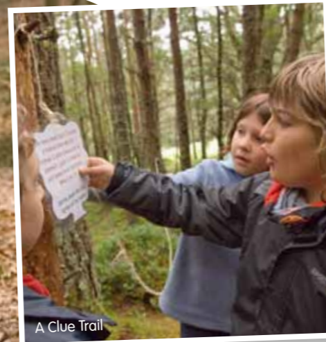
A Clue Trail