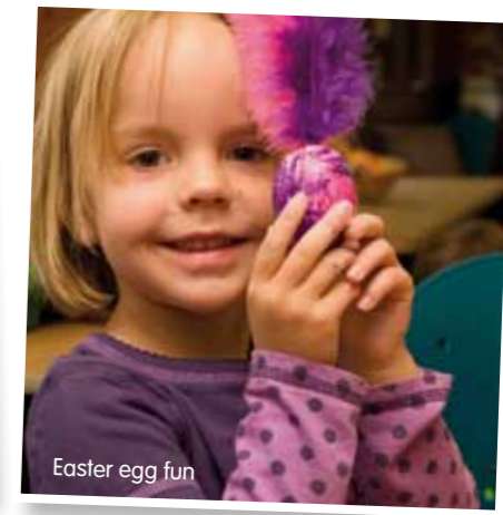
Easter egg fun

Check out what we've got lined up over the coming months. From tots to teens and beyond, there's an activity for you waiting to be enjoyed!