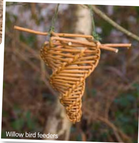
Willow bird feeders