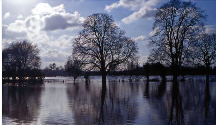
One of the key predicted impacts of climate change is more extreme weather events. The headline-hitting flooding events of the last couple of years are certainly consistent with this aspect of climate change, but we cannot say that they are the result of climate change.