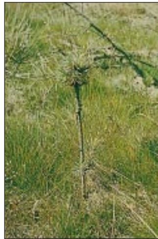
Browsing damage to Sitka spruce.

Rabbit populations are very resilient and can withstand high mortality. It must be considered therefore that there are likely to be some woodland areas where the rabbit problem is so great that current techniques may not be capable of reducing damage to an acceptable level unless virtually unlimited time and manpower are expended.