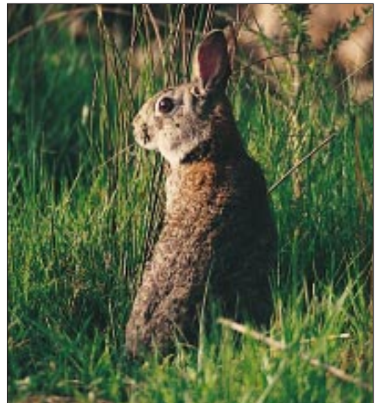
The rabbit: a problem that has increased considerably in the British countryside.

Viral haemorrhagic disease (RVHD) has recently been diagnosed in wild rabbits but cannot be relied upon to reduce numbers, and therefore damage, in a similar way to myxomatosis. Although little is known about RVHD, experience in other countries suggests that rabbit damage may only be reduced in the short-term. Nevertheless, by more intensive use of appropriate control measures, low damage levels may be maintained for longer where rabbit populations are affected by the disease.