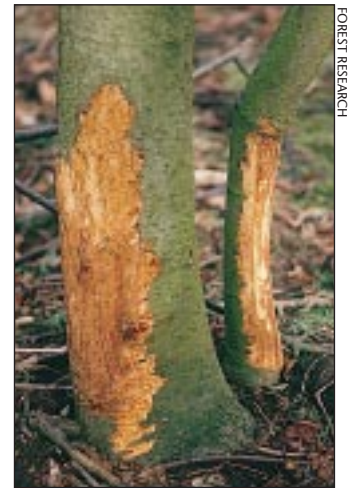
Bark stripping by rabbits.