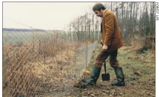
A rabbit fence around a restock area in the Forest of Dean.